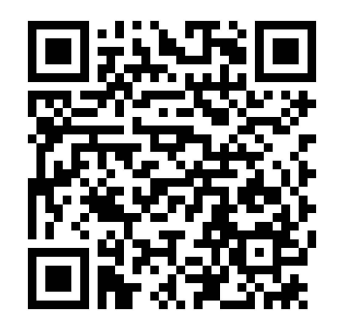
2240 Manuals and Specifications

All of the standard functions of the keyboard are labeled on the Game Inserts . For additional assistance, the QR code below links to the full operations guide and other manuals.